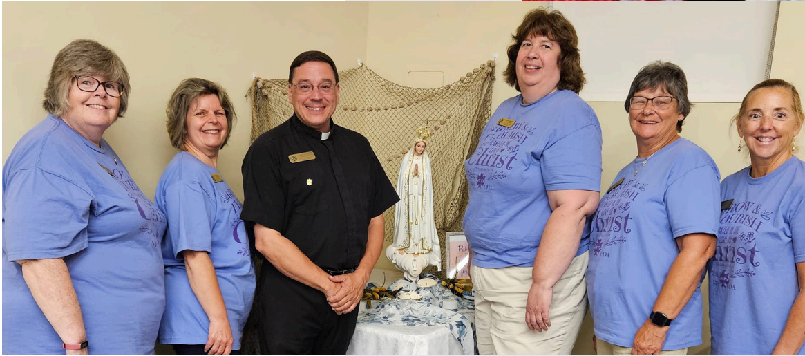
State and Territorial Officers' Conference in Arizona, July 20-23