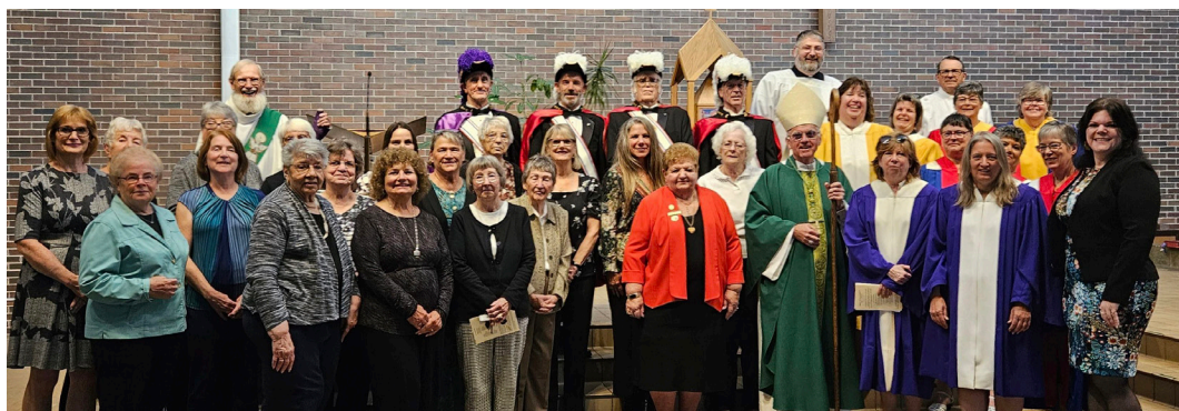
Ct. St. Bernard #787, Saranac Lake, 100th Anniversary, September 17