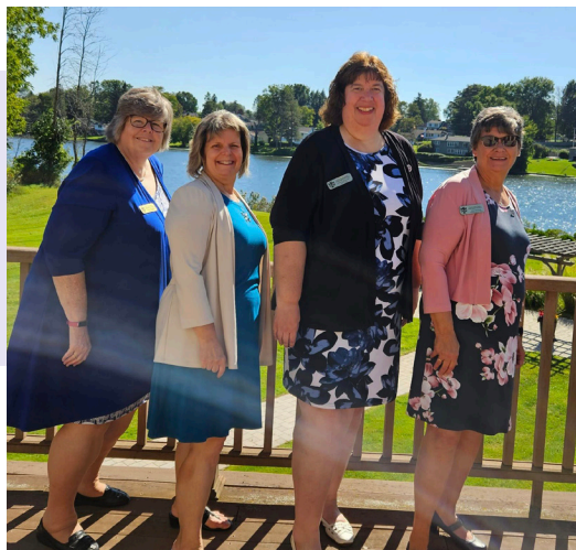
Ct. Père Le Moyne #733, Fulton, 100th Anniversary, September 16